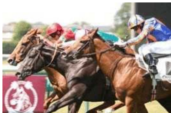
Mutual Trust (Center)

When Mutual Trust stuck his head out to win the Prix Jean Prat two days ago, his win made Cacique the 13th son of Danehill to sire a Group 1 winner in the major Northern Hemisphere countries. In this case, it is unfortunately an example of unlucky 13, as this winner of the GI Manhattan H. and GI Man o'War S. was forced into retirement from the breeding shed by infertility.